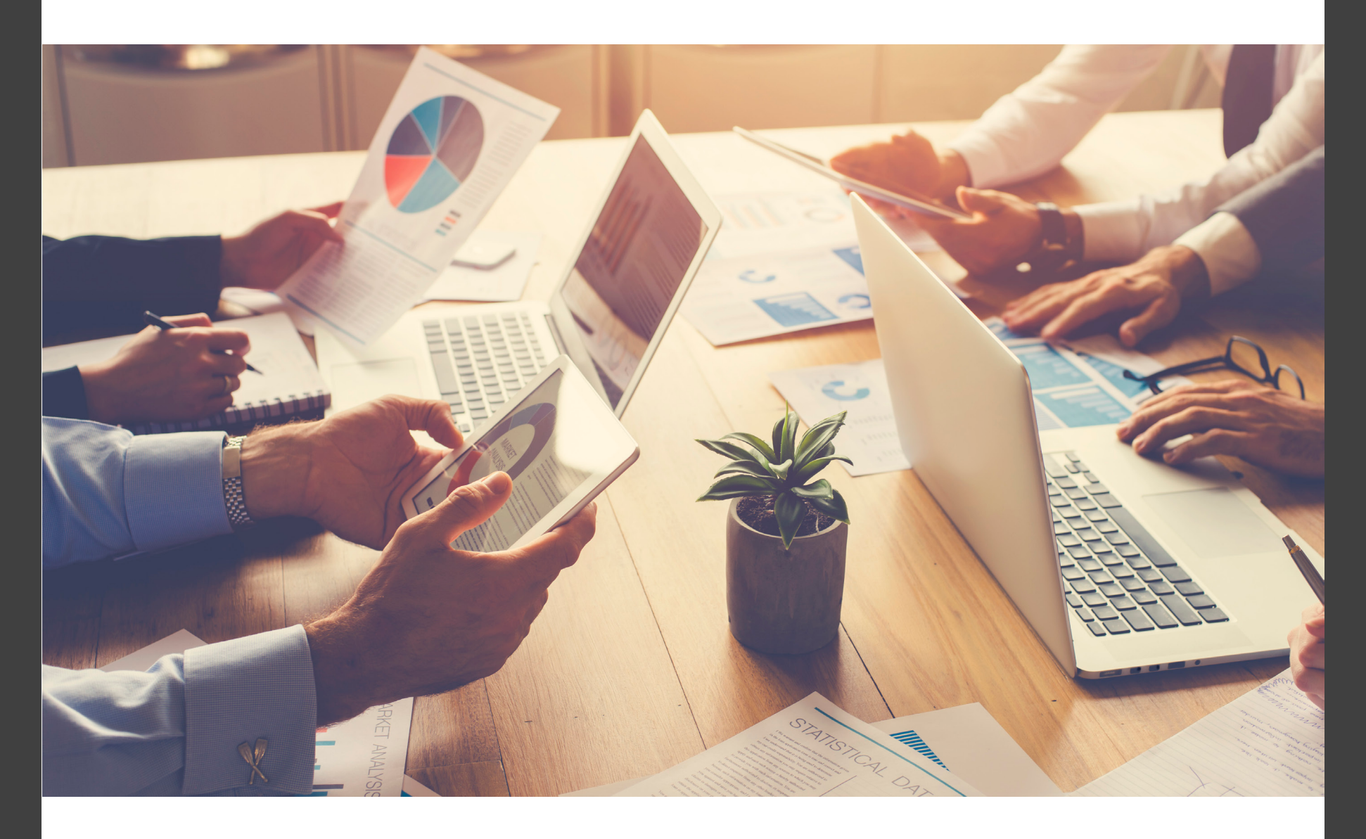
Tip #11: Enable Enhanced Firewall Security

Over 50% of business PCs are mobile, and the increase in Internet of Things (IoT) devices poses new challenges for network security. Mobile device security fully protects data on portable devices, such as smartphones, tablets, and personal computers and the network connected to the devices.